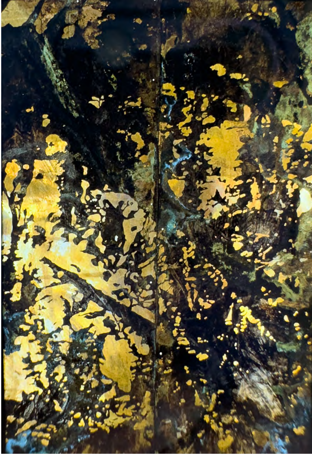
Leaf 2, Copper with patina, 96" x 72", 1993